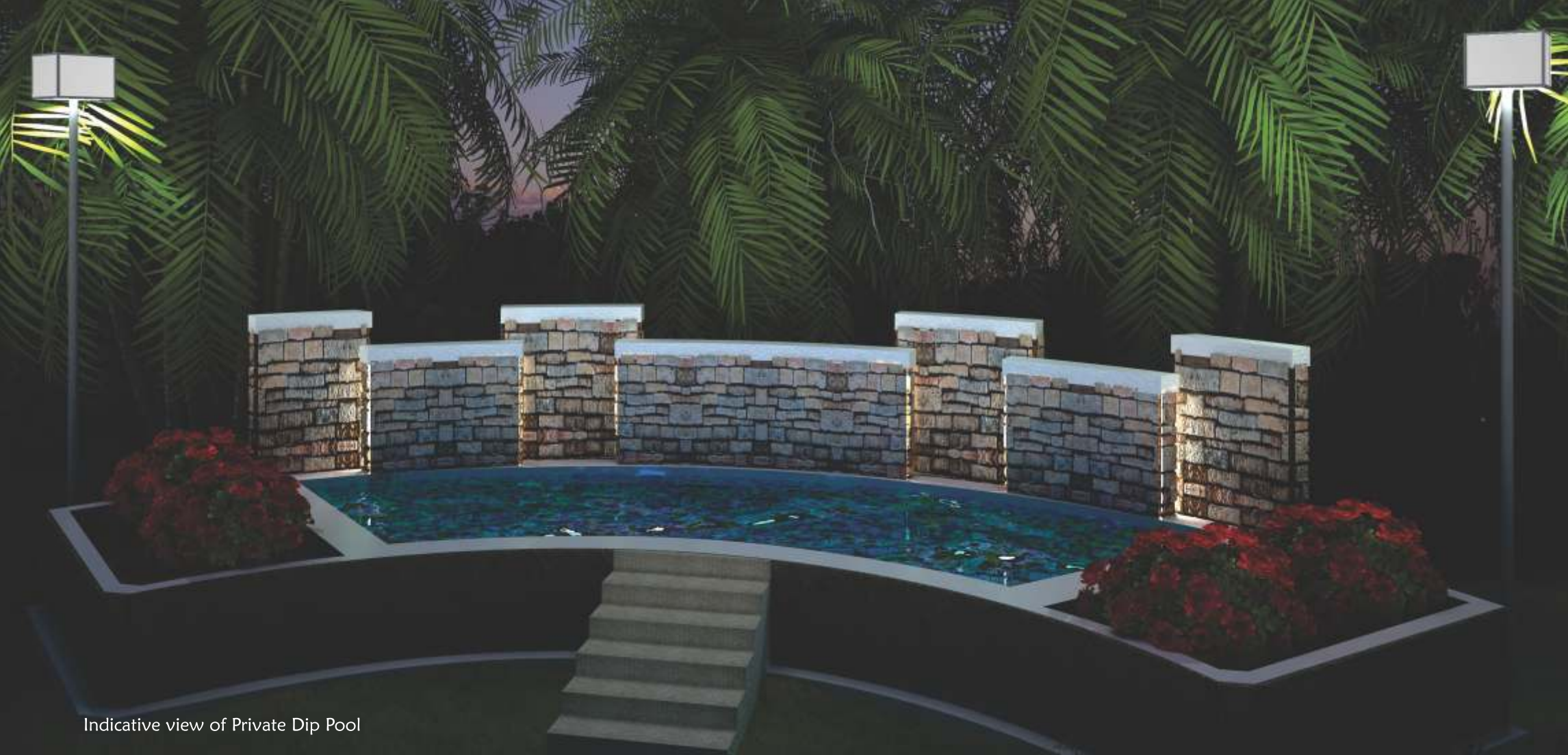
Indicative view of Private Dip Pool